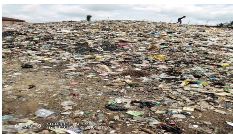
Plate 2. Showing some landfills and dumpsite in Keffi