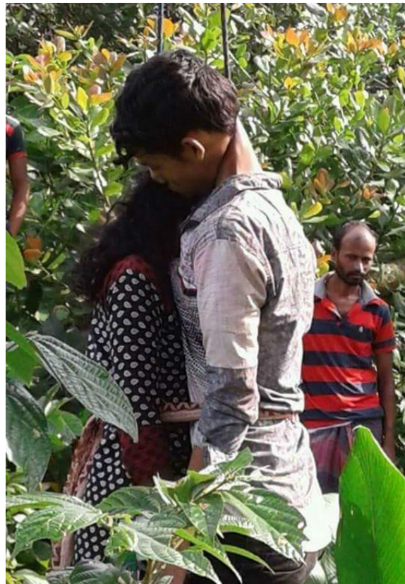
Figure 5. Love couple hanging together from the branch of a tree due to opposition from both the families (different communities)