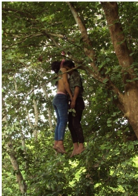
Figure 4. Hanging together facing each other from the branch of a tree due to fear of getting pregnant after being raped