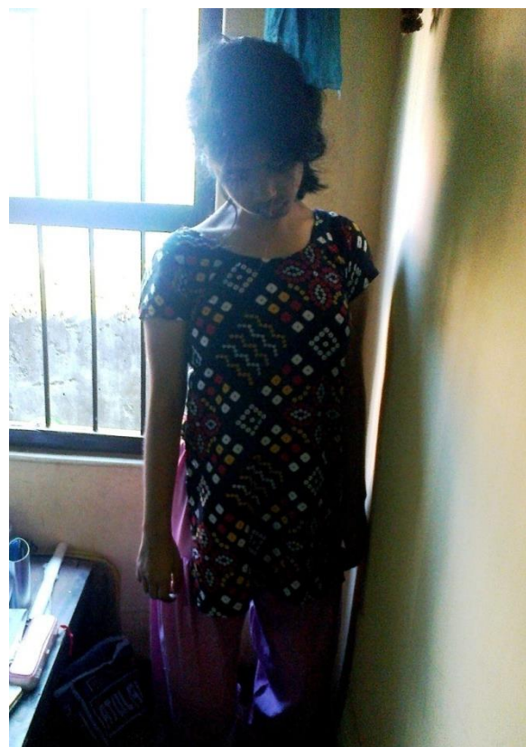
Figure 6. Hanging from a wooden beam for lack of maternal care (step mother)