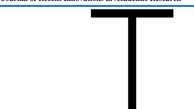
Figure 3. Crux commissa

Augustinian cross comes in variations though it uses the typical Latin cross or crux immissa, a "†-shaped" cross (Figure 4).