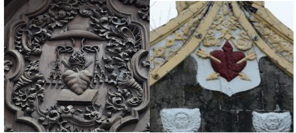
Figure 5. L-R Carvings on the wooden door panel of San Agustin Church, Intramuros, Manila. Source: RPG Tolentino; Edifice adornment on the façade of St. James Church, Plaridel, Bulacan. Source: RPG Tolentino

Nowadays, Christian cross spreads in varieties of form – from pre-Christian religion up to the present time. These forms carry only one religious significance – the passion of Christ. Crosses may found in different embellishment (e.g. pendant, medallion, church ornaments,