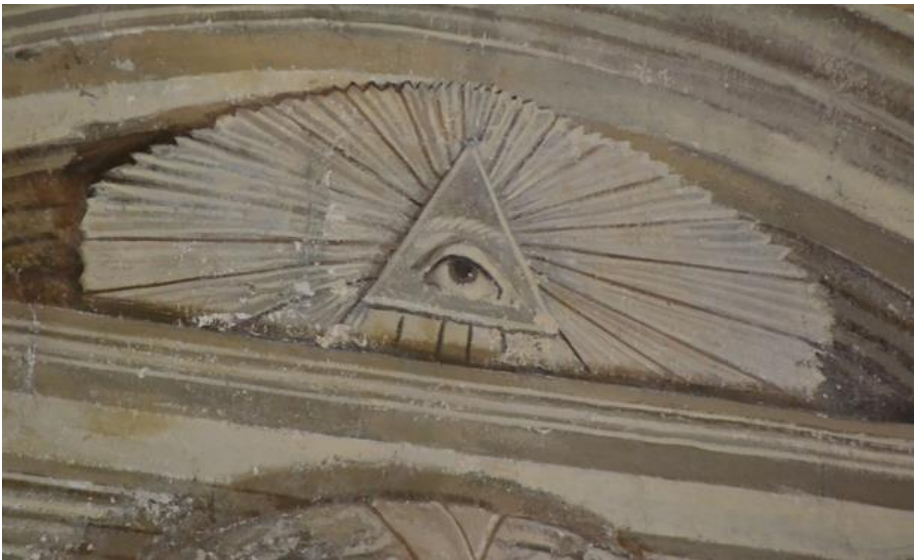
Figure 9. All-seeing eye, Trompe l'oeil in San Agustin Church Manila.

This symbol is also dominant to many organization and usually associated with different meaning and interpretations to many people. Other modern churches also used this symbol as one of their embellishments in their edifice and architecture.