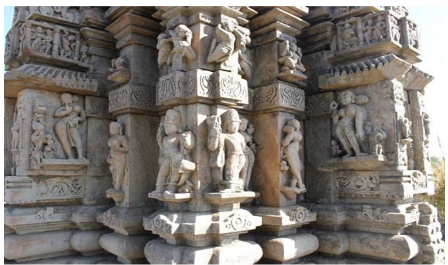
Figure 1. Temple Vimana in Kadwaha

Several studies, in South Asia for instance, deal with the semiotic analysis of architectures and temples (e.g. Kanitkar, 2018; Singh, 2018) share profound ideas on varieties of artworks incised in every wall, pillars and ceilings like in the fifteen temples at Kadhawa India (Figure 1).