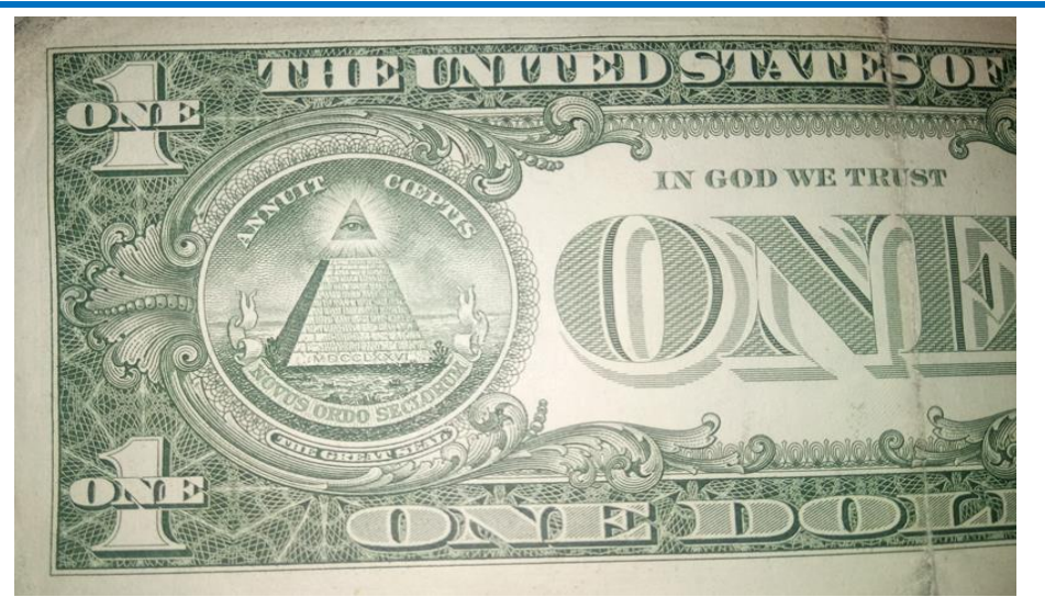
Figure 10. All-seeing-eye at the back of one dollar bill.

The all-seeing-eye can also be seen at the back of one dollar bill (Figure 10). There is conspiracy that this symbol is associated with freemasonry and even illuminati (e.g. Dice, 2009; Cassaro 2011). Sacred architecture brings not only aesthetic beauty. It has lots of symbolic embellishments and decorations which may give additional explanation on the cultural discipline and spiritual characteristics. Symbols travel through space and time resulting to adoption and adaptation of those who use it as their emblemic identity. The result of this investigation gives the idea on the probability that Christian religion—in the Philippines was influenced by other sacred societies. Part of the hypothesis is that the Augustinians and Franciscans adopted beliefs and cultures from other sects and societies. It needs a thorough and intensive semiotic archaeological research to deeply understand the history and provenance of these symbolic emblems. With this, it may reconcile the complexity of different interpretations to the symbols caused by symbol transference, not only those used by Augustinians and Franciscans, but also the different modern sects that are emerging in the present time.