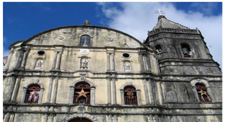
Figure 6. St. Michael the Archangel church, Tayabas, Quezon.

architectural plans etc.). In some instances, Franciscan architecture also uses crux immissa and other forms of cross (e.g. St. Michael the Archangel church in Tayabas, Quezon).