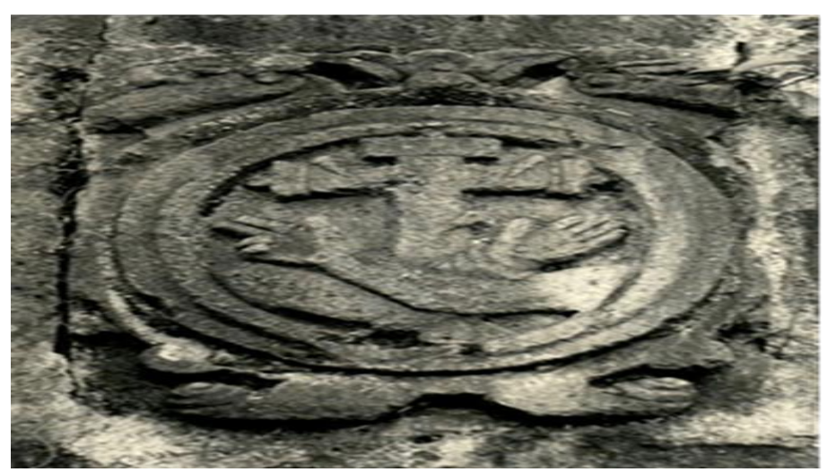
Figure 7. Franciscan seal found on the St. Michael the Archangel, Taytay, Quezon.

A Franciscan seal (Figure 7.) is also visible to the church. This is a symbol of Franciscan frays who lead the parish on the Hispanic era. This symbolizes the unity of Christ and San Francisco de Asis. The seal can be found in wall of the basilica fronting the Alitao River.