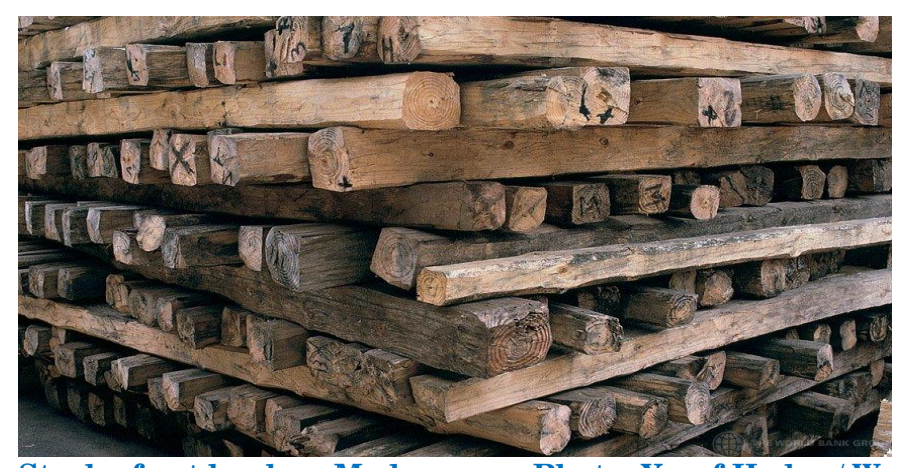
Figure 2. Stack of cut lumber. Madagascar.

Fossil fuels are also exploited and contribute to pollution; burning fossil fuels warms the planet and acidifies the oceans by releasing carbon and other greenhouse gas emissions into the environment. In spite of contributions to air pollution and oil spills on sea water etc. the exploitation of fossil fuel will continue, till alternate sources are identified. In Indonesia and Malaysia-the top two palm oil producing countries-palm oil cultivation is largely unregulated and is depleting tropical forests, which are important carbon sinks and habitats for endangered species. Due to deforestation the forest fires have become more frequent and more damaging.