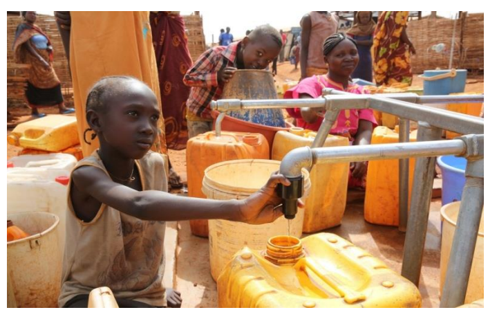
Figure 1. Young girl collecting water at an internally displaced persons camp in Wau, South Sudan.

Fossil fuels are also exploited and contribute to pollution; burning fossil fuels warms the planet and acidifies the oceans by releasing carbon and other greenhouse gas emissions into the environment. In spite of contributions to air pollution and oil spills on sea water etc. the exploitation of fossil fuel will continue, till alternate sources are identified. In Indonesia and Malaysia-the top two palm oil producing countries-palm oil cultivation is largely unregulated and is depleting tropical forests, which are important carbon sinks and habitats for endangered species. Due to deforestation the forest fires have become more frequent and more damaging.