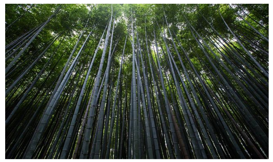
Figure 5. Bamboo trees- victims of human over consumption Deep sea mining

Soil: It can take more than a millennium to produce 1 centimeter of soil, yet humanity has degraded roughly a third of all the world's soil, according to the UN, and half of all topsoil has been lost in the past 150 years. The primary drivers of this loss include industrial pollution, erosion, bad agricultural practices, real estate development, saltwater contamination, and others. For example, farming a single crop (monoculture farming) on a piece of land with the help of pesticides-the primary mode of farming in the world-has caused widespread soil degradation throughout the world. Since 95% of the food that humans eat comes from soil, the continued degradation of soil poses an existential risk.