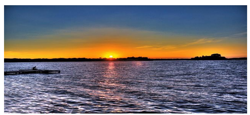
Figure 3. Sunlight- a most natural resource

The Biotic natural resources are the ones that come from the ecosphere (organic and living materials). These include resources such as animals, forests (vegetation), and other materials obtainable from them. Fossil fuels such as petroleum, oil, and coal are also included in this grouping because they are generated from decayed organic matter. The abiotic natural resources are the ones that come from non-organic and non-living materials. Examples of abiotic natural resources are water, land, air and heavy metals like iron, copper, silver, gold, and so on. Stock natural resources are those that are present in the environment but the necessary expertise or technology to have them exploited. Hydrogen is an example of a stock natural resource.